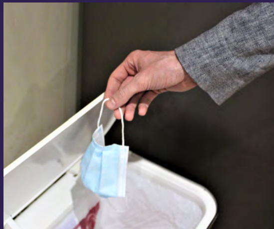
Dispose of in a lidded bin