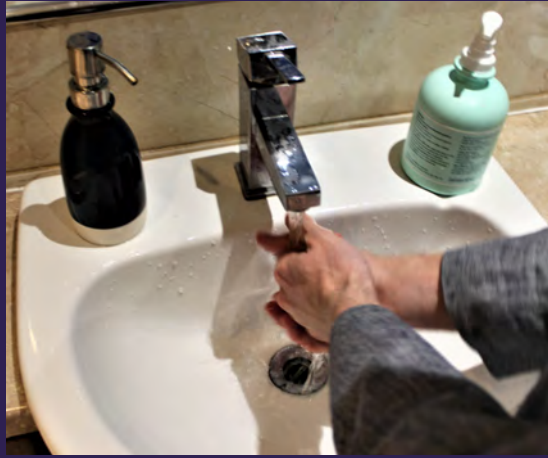
Wash or sanitise your hands