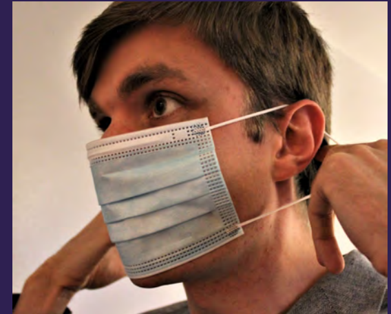
Gently remove using ear loops