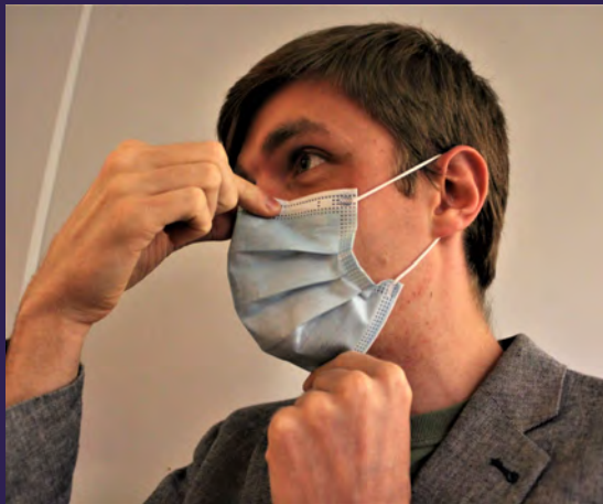
Secure to your nose and cover your chin