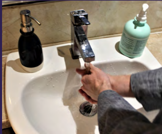
Wash or sanitise your hands