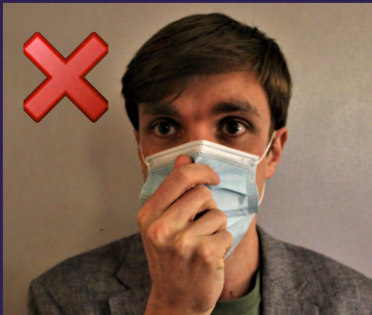
Do not touch the outside of the mask