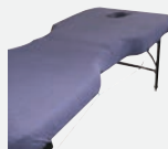
Affinity Shaped Towelling Couch Cover