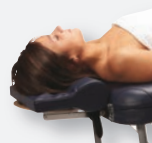
Affinity P-shaped Neck Bolster