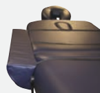
Affinity Side Arm Extenders