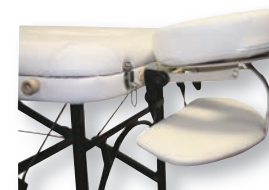
The Power Therapist Upgrade Pack can be added to the Affinity Marlin

"FitBack Physiotherapy use the Affinity Marlin Treatment Couch. We supply onsite Physiotherapy services to businesses throughout the UK and require a smooth, quick, hassle free service to supply treatment couches to our clients. The Affinity Marlin Couch is light weight and durable and fits our requirements exactly. I know I can rely on next day delivery of a couch which takes away the stress of supply."